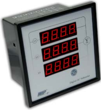
W-DV403 Digital Voltmeter 3Ø Code : 3103